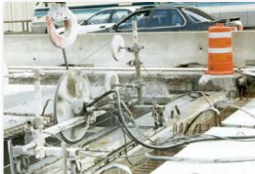
EXTREME WORKING ENVIRONMENTS AT BRIDGE SITES

For 28 years, in over 1,000 projects nationwide, Bluegrass has used the controlled technologies of diamond wire sawing and robotic hammering to solve demolition challenges in demanding work environments. Bluegrass' skilled professionals are experienced in concrete and metal cutting and removal for a broad range of industries: Nuclear, Industrial/Plant, Hydro, Bridges, Chemical, Gas and Commercial. Bluegrass is the industry leader in resources with 30 technicians, 25 robots, 35 diamond wire saws, 100,000 linear feet of diamond wire as well as project support personnel, mechanics, a fully equipped and manned machine shop capable of customizing fixtures for any specific project requirement.