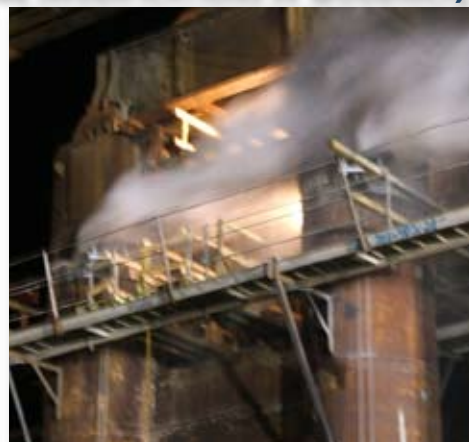
Cutting in progress of the east twin pier.