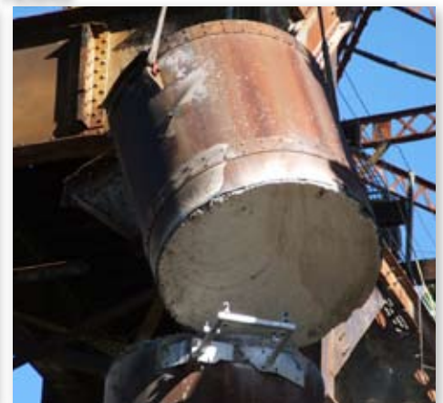
Removal of the 18.5 ton concrete pier.