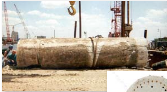
UNDERWATER CAISSON CUTTING, REMOVAL AND SMOOTH CUT CONCRETE FINISH.