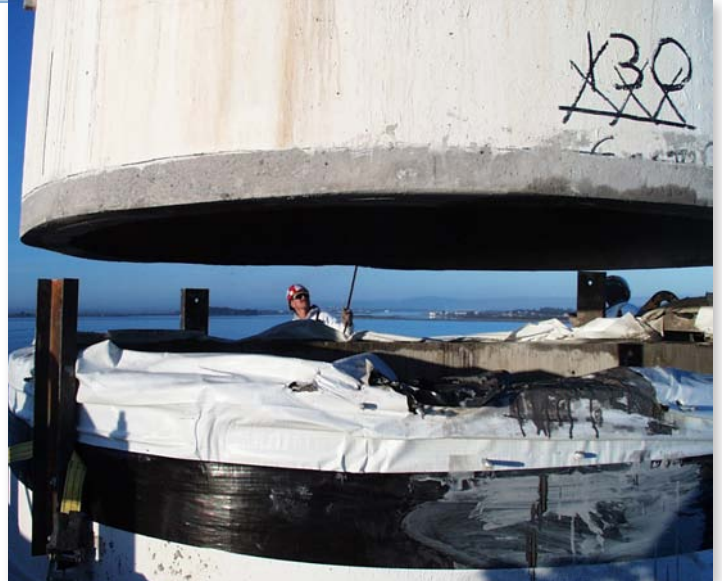
Stack Removal Humboldt, CA