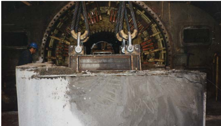
Turbine Retrofit Queens, NY

Turbine pedestals, compressor, pump, coal handling, bioshield, draft tube, fish bypass, and many other concrete structures.