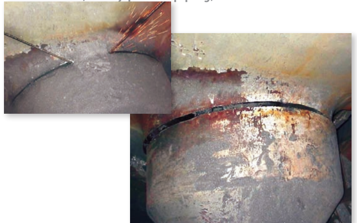
Reactor Nozzle Cut San Onofre, CA

Inconel, steel, stainless, tube bundles, reactor nozzles, reactor heads, heavy process piping, and draft tube liners.